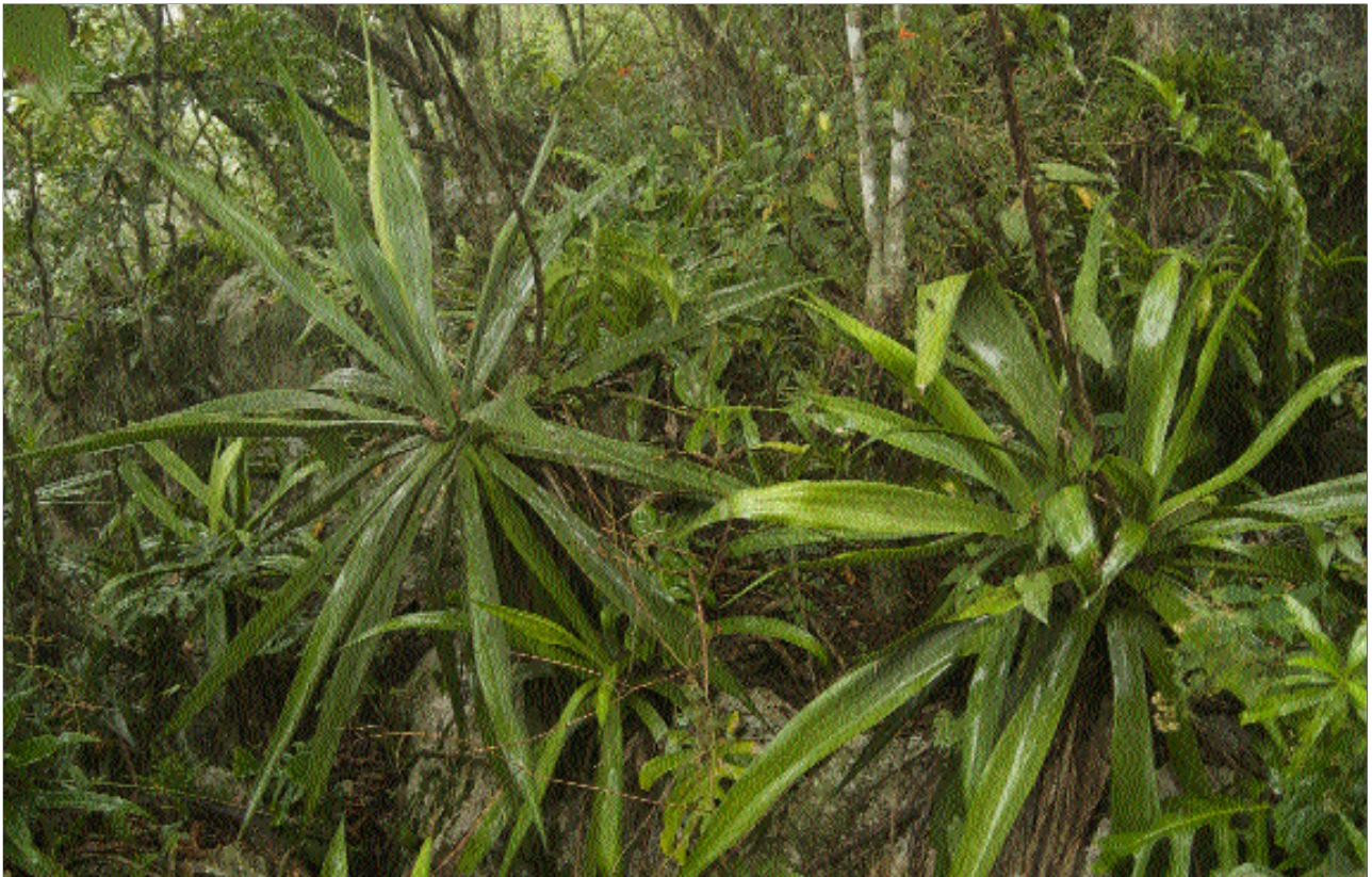
Agave gomezpompae , habitat, Mexico.