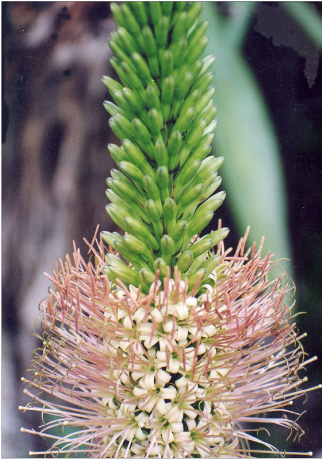
Agave gomezpompae, infl., habitat, Mexico