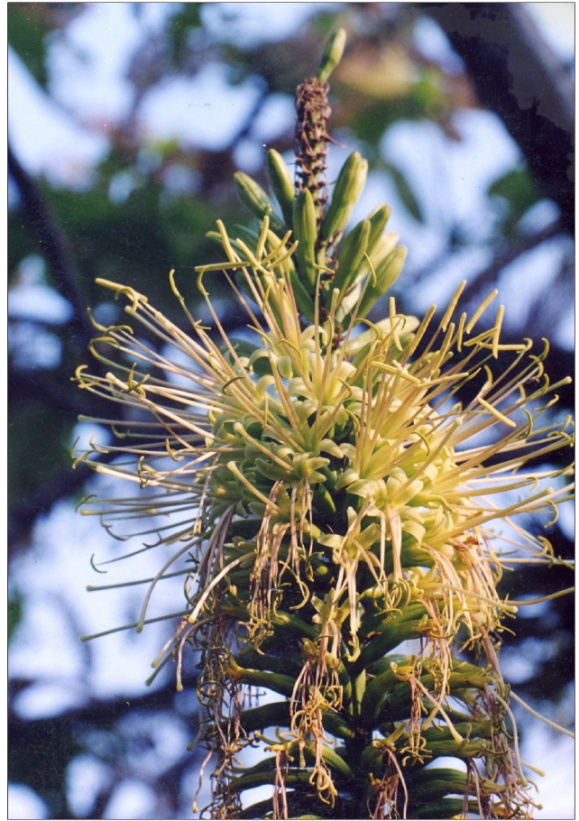
Agave gomezpompae, infl., habitat, Mexico