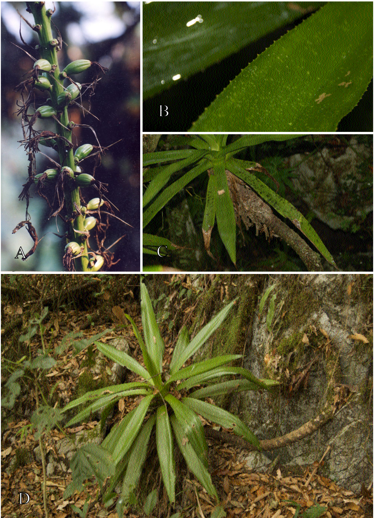
Fig. 2 Agave gomezpompae Cházaro & Jimeno-Sevilla. A. detail of inflorescence ; B. detail of the leaf denticulation ; C. detail of stem; D. habit.