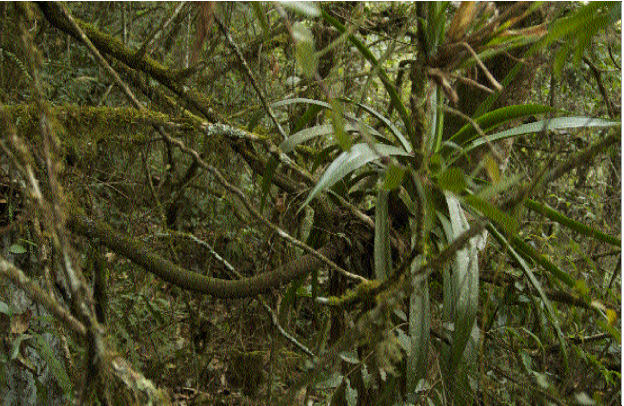
Agave gomezpompae , habitat.

of Mexico, in Mexico city, that later on became the national collection of Agavaceae and Nolinaceae.