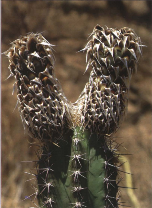
9. Dried fruits with many scales.