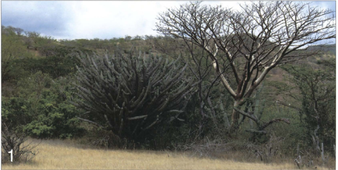
1. Lemaireocereus lepidanthus , landscape of Monte Espinoso in Guatemala