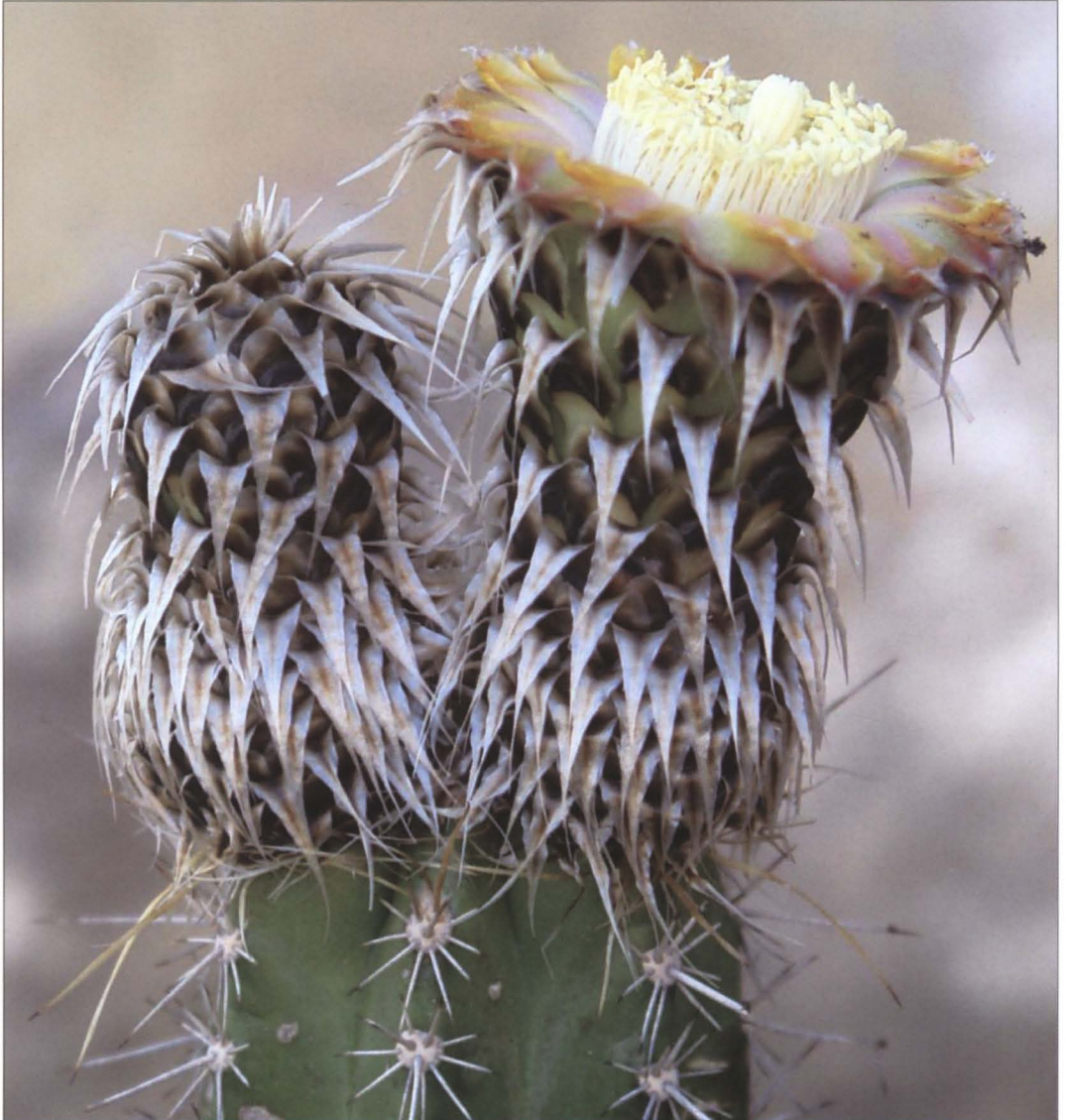
Lemaireocereus lepidanthus , flowering in habitat, Guatemala (photo : M. Véliz).

Habitat: unfrequent species, it grows together with Stenocereus pruinosus , Pilosocereus leucocephala , Nopalea guatemalensis , Melocactus curvispinus , Mammillaria voburnensis var. Eichlamii , Guaiacum coulteri , Juliania adstringens , Malpighia puniceifolia , Plocospermum buxifolium , Bursera schlechtendalii , Ceiba aesculifolia and Ximena americana , in a deciduous-thorny low forest.