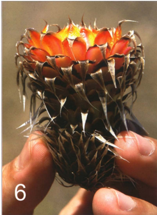
6. vue de côté d'une fleur qui se trouve semi-ouverte durant le jour.

Treelike cactus , 3 - 5 m high, columnar, branched out from the base and when the apical region is damaged, 1-6 branches, branches 4-7 cm in diameter, dark green to greenish yellow; 6-9 ribs, thin, 3-4 mm wide and 8-12 mm high; areoles rounded, whitish, 2-3 mm in diameter, densely tomentose-glandulose, hairless and grey when old, separated by ca. 1 cm; radial spines 7-11, 3-6 mm long, bulbous at the base, stiff, straight, reddish at the beginning, then dark grey; central spines 1-3, 6-22 mm long, bulbous at the base, grey, stiff, at first reddish; flowers nocturnal, growing at the tip of branches, campanulate, 5 - 7 cm long, 3-4 cm wide; Densely covered with papyraceous scales at the tip and fleshy at the base, 19-22 mm long, 5-8 mm wide, bicoloured, light brown, dark brown or black at