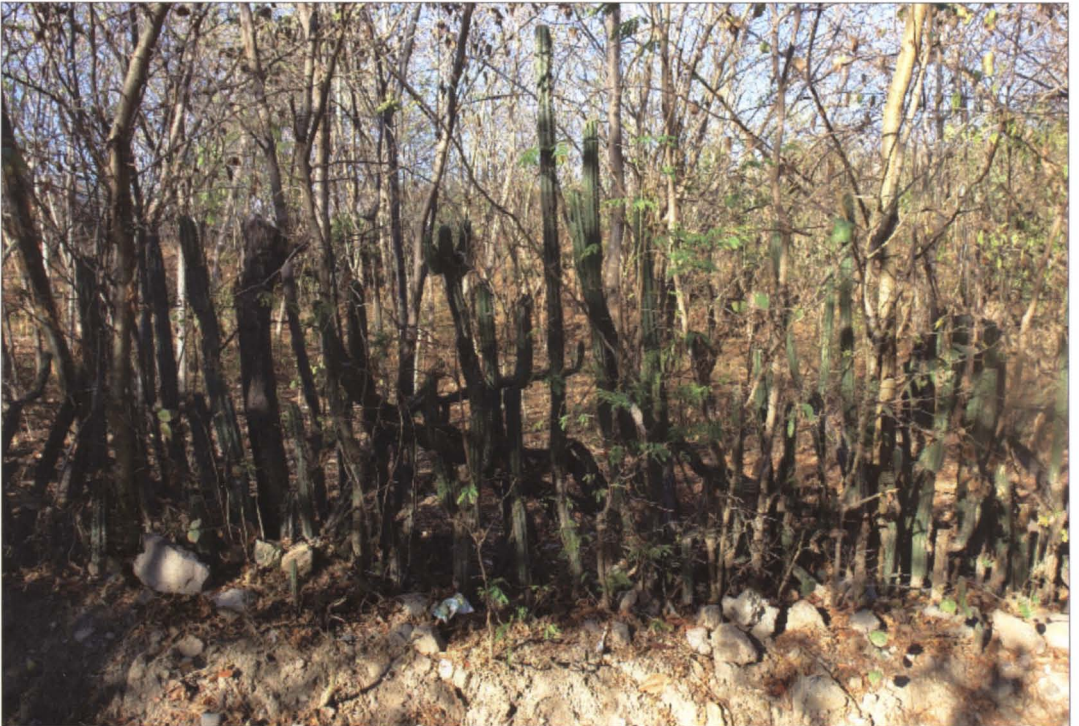
Quickset hedge made of Lemaireocereus lepidanthus at Chiquimula, Guatemala (photo : M. Véliz).