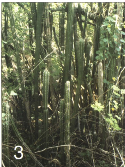
3. Plentiful branches at the base of the stem. (photo : M. Véliz).