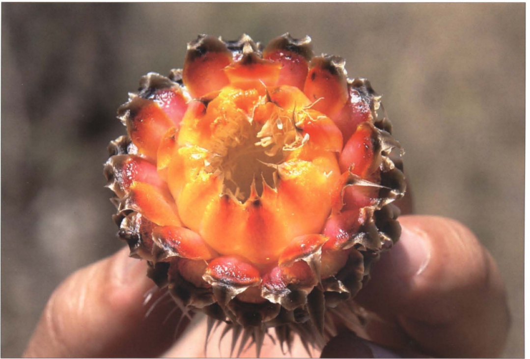
7. During the day the flower is almost opened.