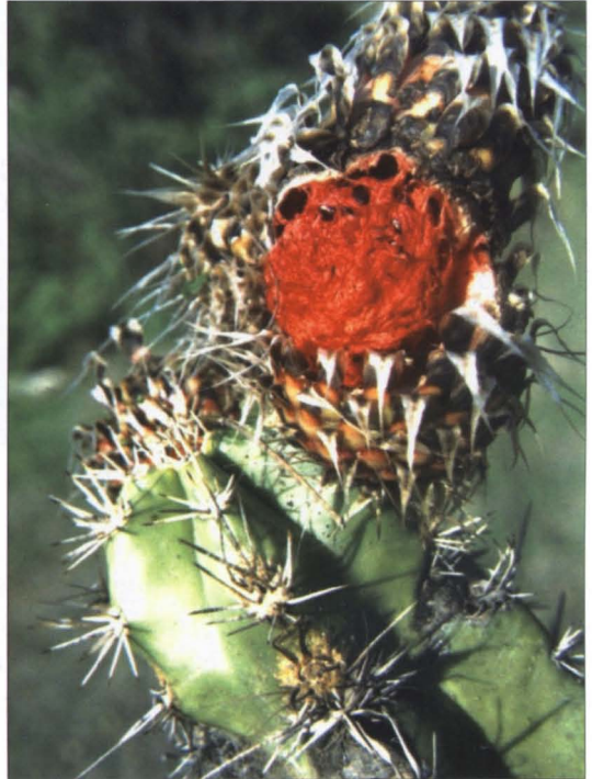
10. Fruit where the pasty, reddish pulp is observed.