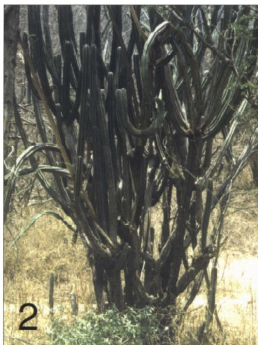
2. Lemaireocereus lepidanthus , habitat.