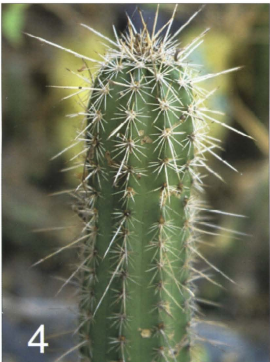
4. Sight of a grown-up branch.