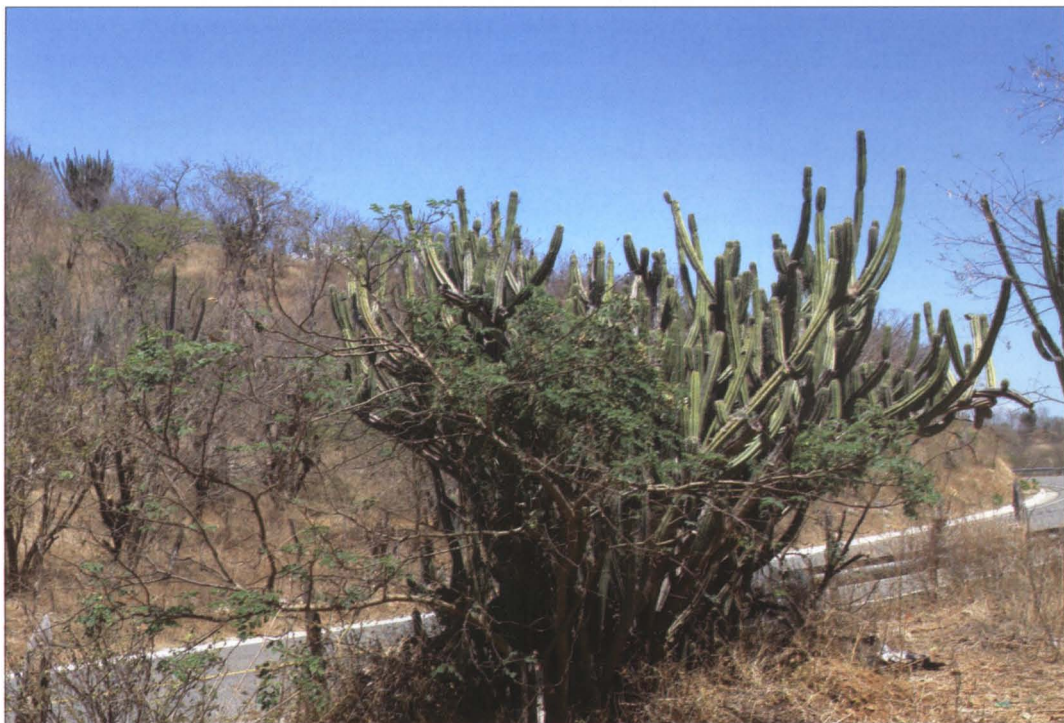
Lemaireocereus lepidanthus , habitat, Guatemala.

generally transverse dehiscence; scales many, papyraceous; areoles tomentose with 2-6 bristles, light to dark brown, 10-20 mm long; pulp pasty, reddish; seeds black, shiny, 3-3.5 mm long, 2-2.7 mm wide (see photos).