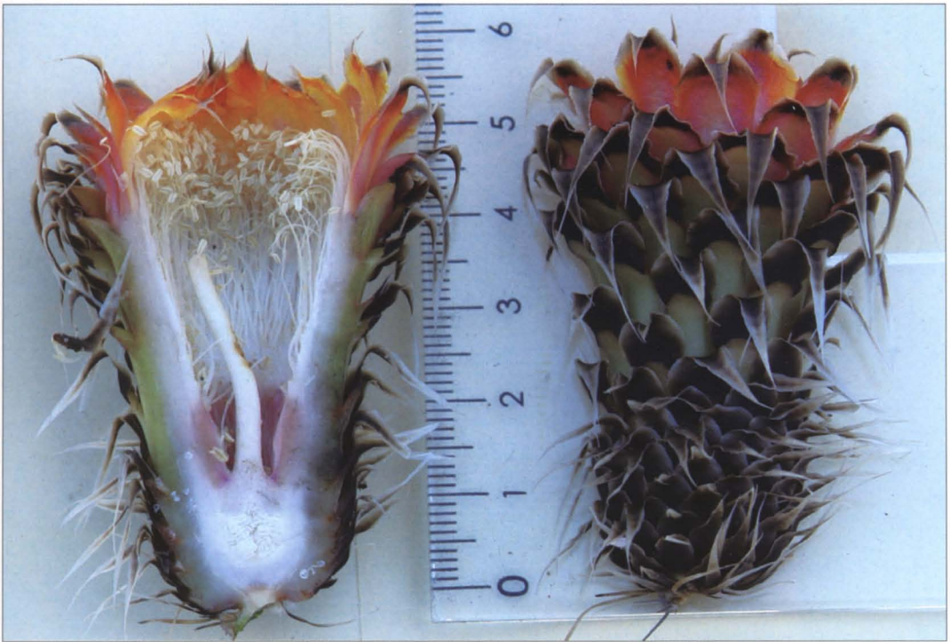
s8. Lemaireocereus lepidanthus , sight of the androecium and the gynaecium.